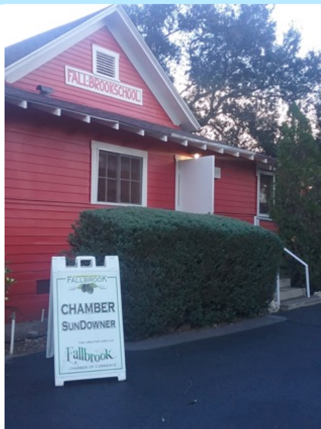
Over 80 Chamber of Commerce Members attend Sundowner Event at Historic Reche Schoolhouse on February 21, 2018