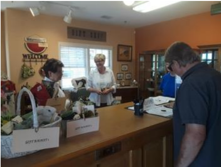
THE NEW GIFT SHOP

Thanks to all who came out to our Open House on June 26 th ! It was great to see everyone again! A few highlights: