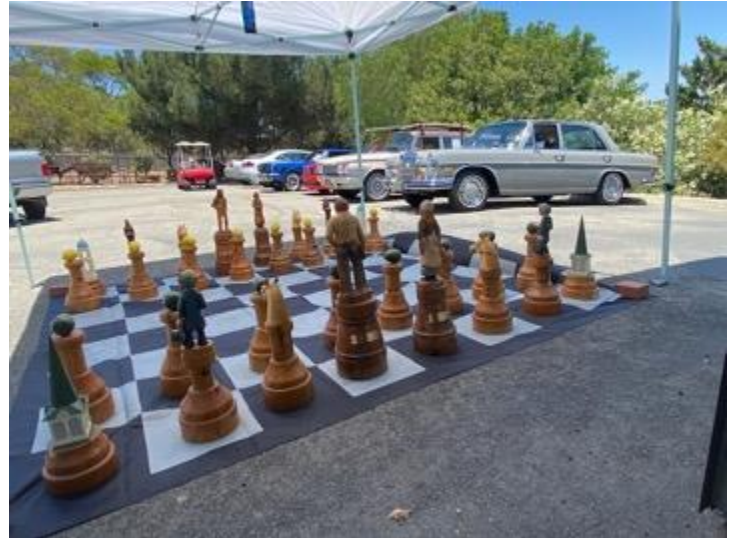
HAND CARVED CHESS SET ON DISPLAY