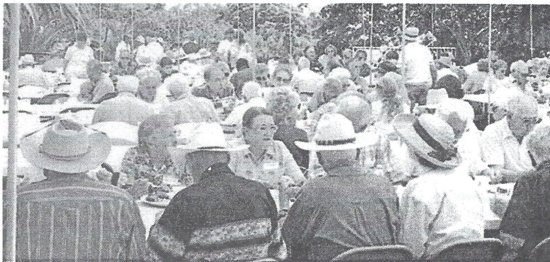
Table service, coffee, punch provided for your use

Starts at around 11 a.m., potluck begins at noon. Come early – stay late!! The museums will be open for your convenience. It is not just for oldtimers.. everyone is welcome. Just an old-fashioned get together. Make this year our most successful!! Please plan to attend.