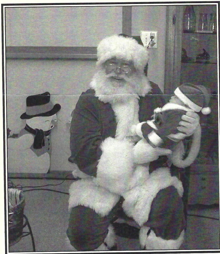
Last year's Santa with 1-month-old baby Santa. We will have the same Santa visiting this year.

Deck the Halls! On Saturday, December 14, the Fallbrook Historical Society will open its doors at 11:00 a.m. for a Holiday Open House. It is our way to share the Christmas spirit with our community and to invite all residents to enjoy the buildings in our complex decked out with their finest holiday décor. The Society will host tours of the Pittenger House, the Museum, the Ford Room, the Rock and Mineral Room and the Barn. A giant Christmas tree will be featured in the Barn along with a visit from Santa Claus. (Don't forget to bring your camera!) An Arts and Crafts area will also be featured in the Barn so that all children will create their own unique tree ornament to take home. Refreshments will be served, featuring Coffee, Hot Chocolate and Sugar Cookies. The event is free and open to the general public. We hope you all will bring your families and friends to join us in celebrating this wondrous holiday.