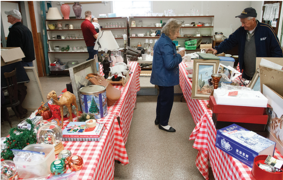
Photo above, courtesy of the Village News, was taken during the Fallbrook Historical Society's Christmas Open House festivities in 2019.

The weather says it's summer, the calendar says it's fall, but the Fallbrook Historical Society is preparing for its annual Christmas Open House – the biggest event of the year – scheduled to take place Sunday, Dec. 5. Festivities will take place from 2 to 6 p.m. at the Heritage Center located at the corner of Rocky Crest and Hill Avenue. This year's theme is "A Whistle Stop Christmas."