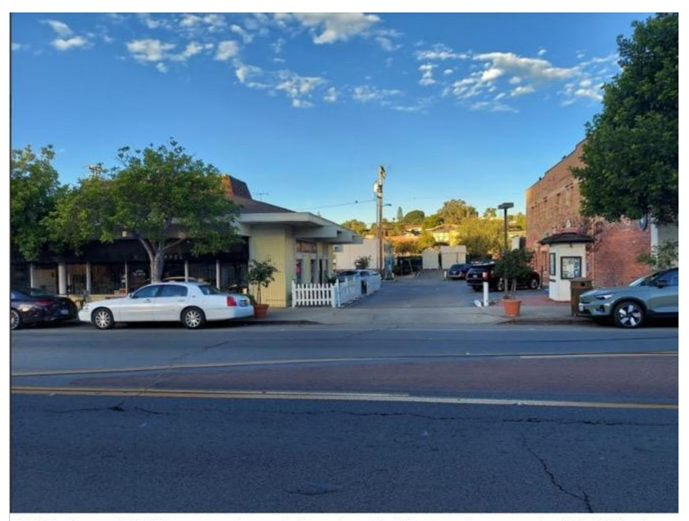
2023. Tommy's Café was once located about here in this space between the 1930 El Real Hotel and the coffee shop at Fig St. & Main.