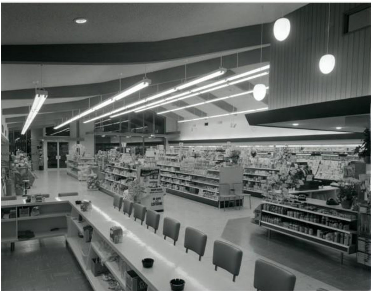
1960s. Harrison's popular lunch counter. Pharmacy is at the right. Customers were offered a free soda drink while waiting for a prescription. Notice the ashtrays.

Then, ten years later in 1973, Thrifty Drug Stores opened a bigger store just a few blocks south at the corner of Clemmens Lane and Mission Rd. Alpha Beta (later Lucky's) opened a nearby grocery store with a pharmacy that also sold alcohol. Alpha Beta was located in between Thrifty Drug and the Harrison store. (6)