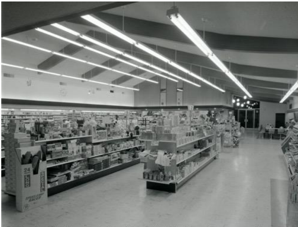
1960s. Interior Harrison's Drug Store. Looking from front to rear doors. Lunch counter is right rear, pharmacy is in left rear corner below office space.